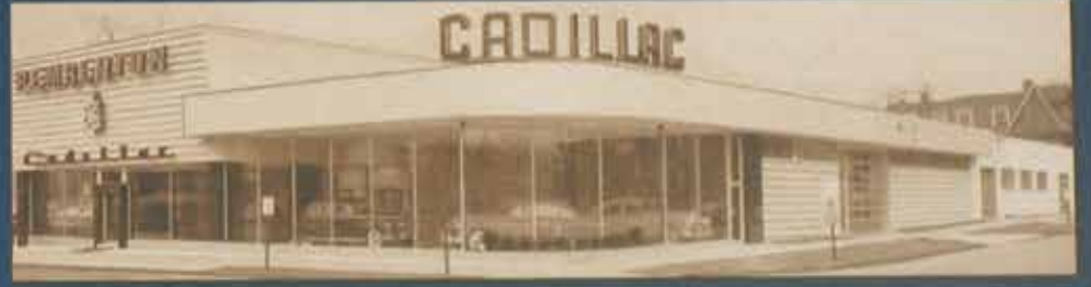
1949 Pemberton Cadillac Dealership Toledo, Ohio