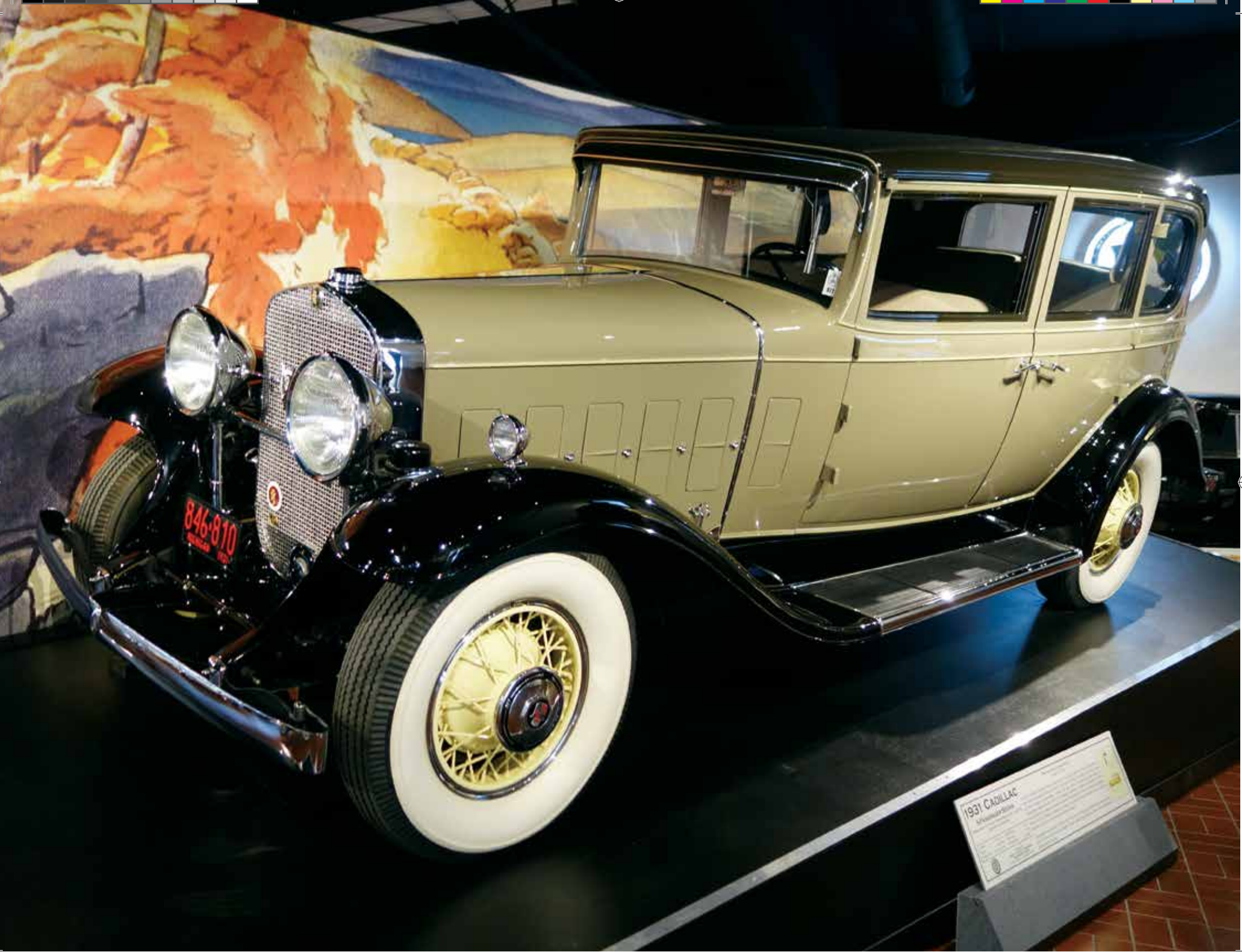
1937 LaSalle convertible sedan in the showroom