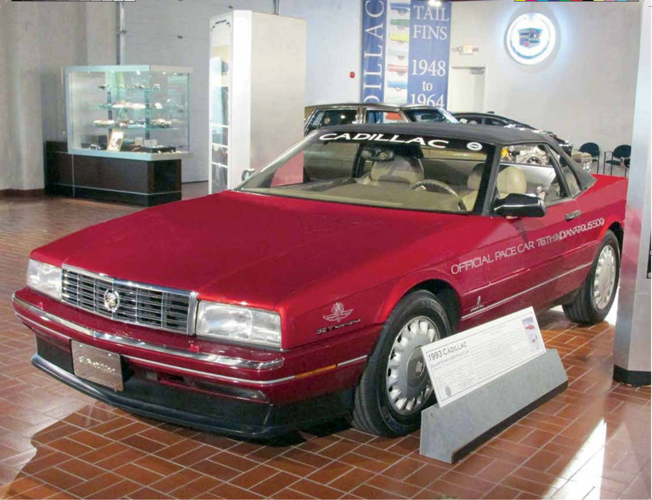
Clockwise from top: Museum groundbreaking September 29, 2013; Sign announcing the construction; Iwo Jima style raising of the 1930s Cadillac & LaSalle porcelain enamel sign