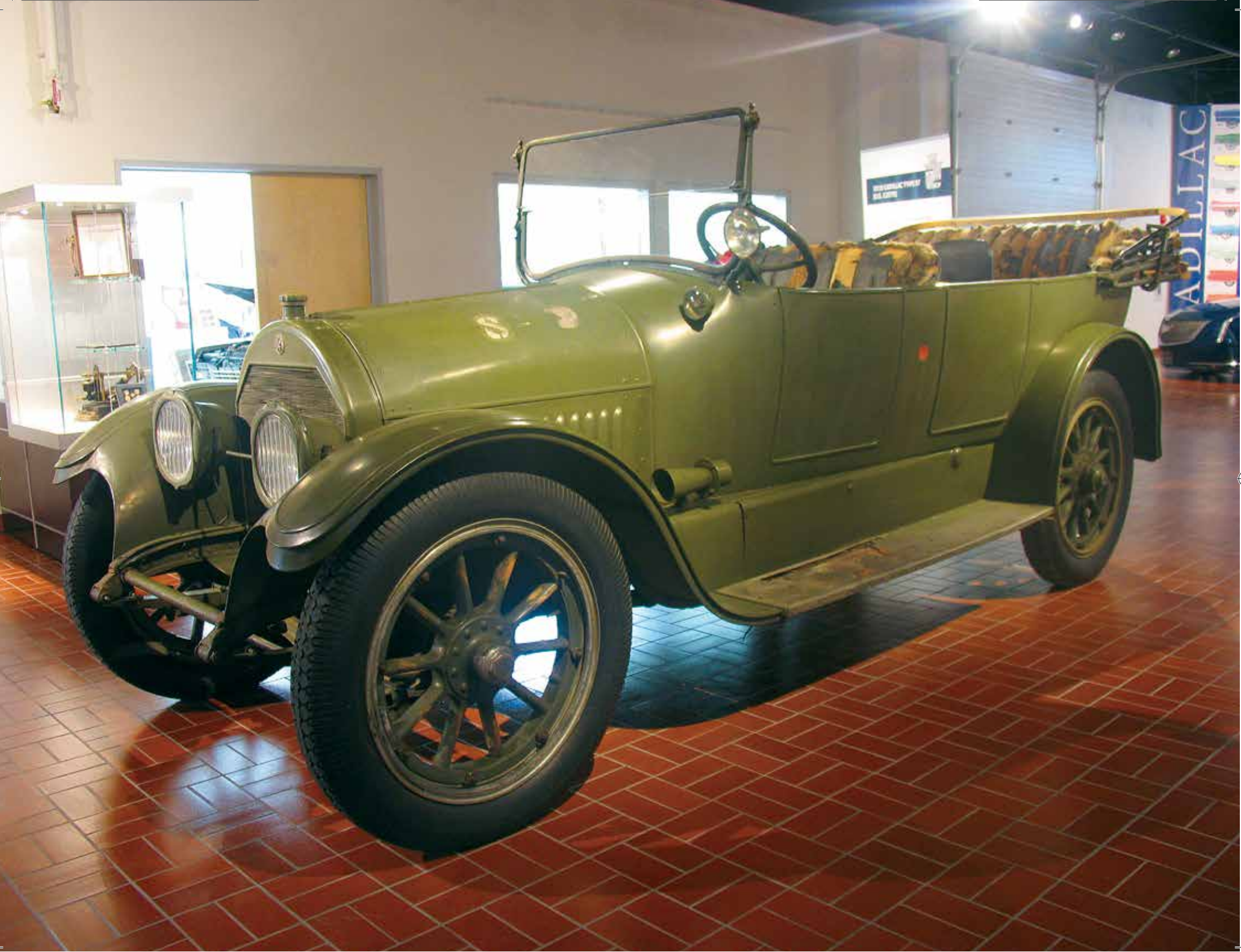
1918 Type 57 Cadillac touring car - used in WWI