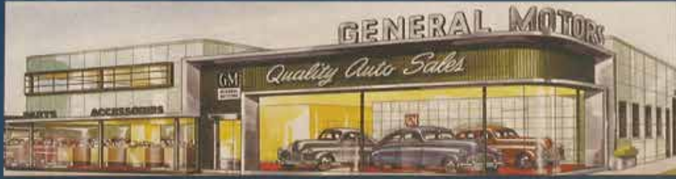
1948 GM Dealership Recommended Design #5