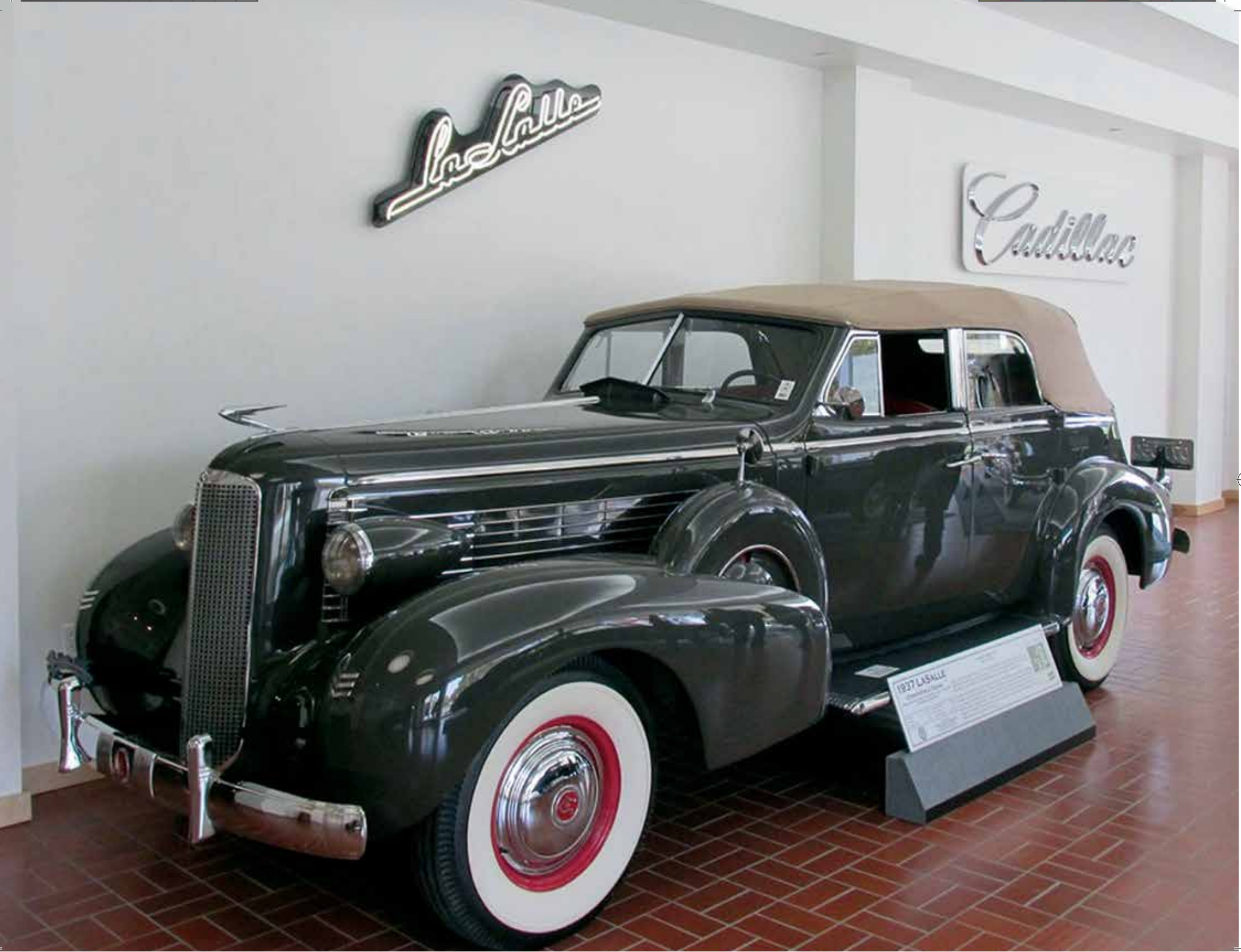
1931 Cadillac Series 355A V8 5 Passenger Sedan