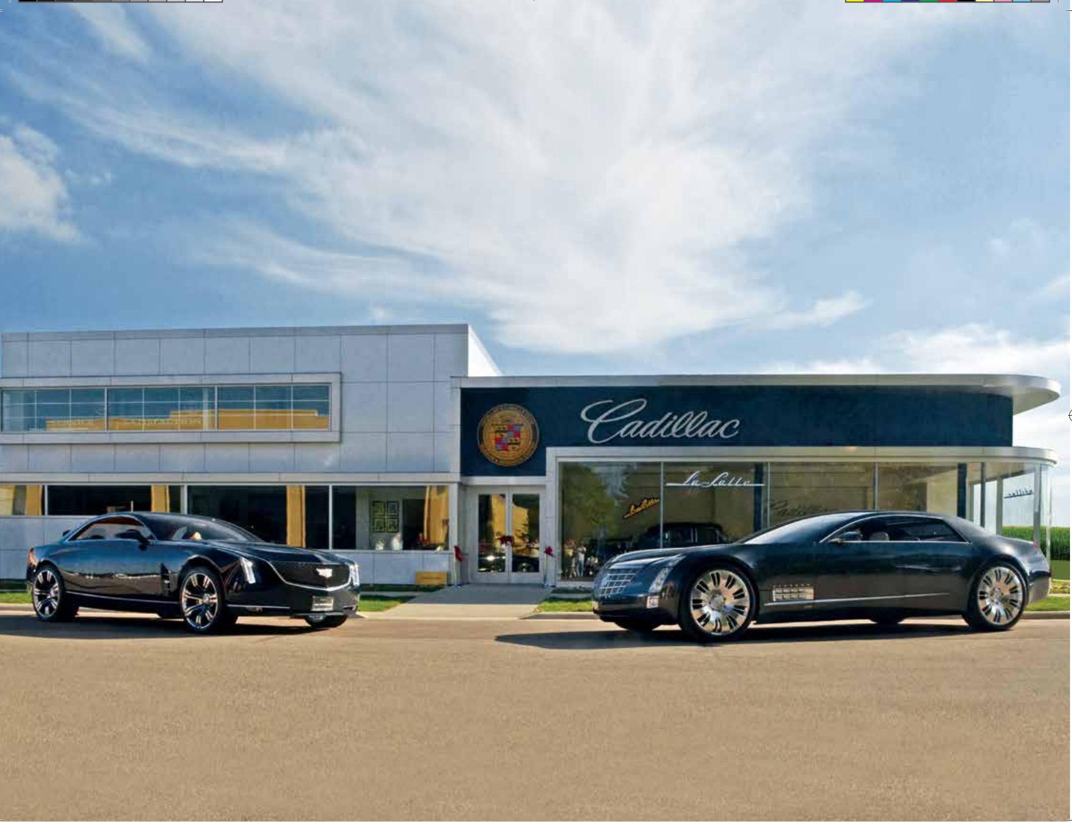
Upper photo - Gilmore Car Museum grounds ca: 2010